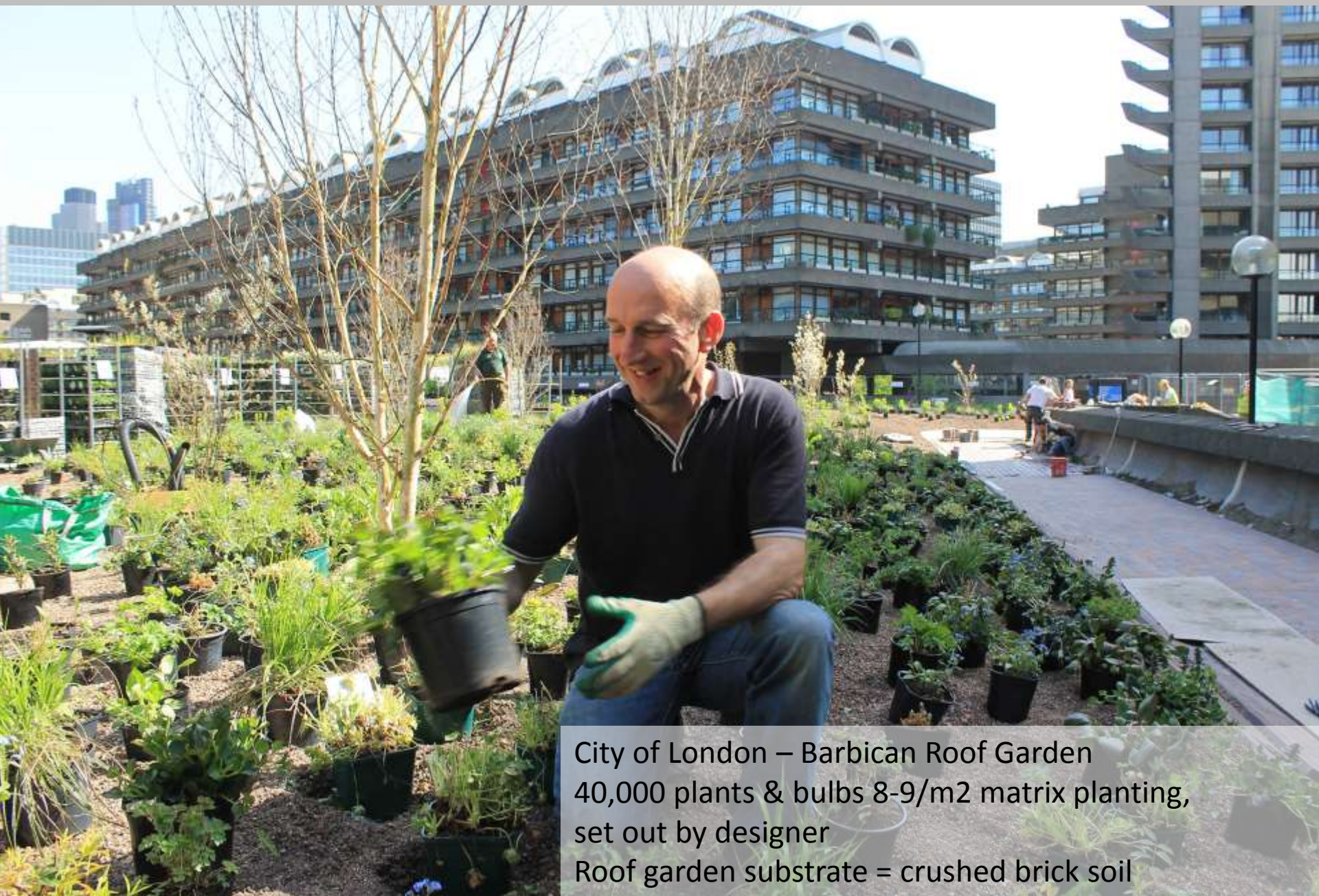
City of London – Barbican Roof Garden 40,000 plants & bulbs 8-9/m 2 matrix planting, set out by designer Roof garden substrate = crushed brick soil