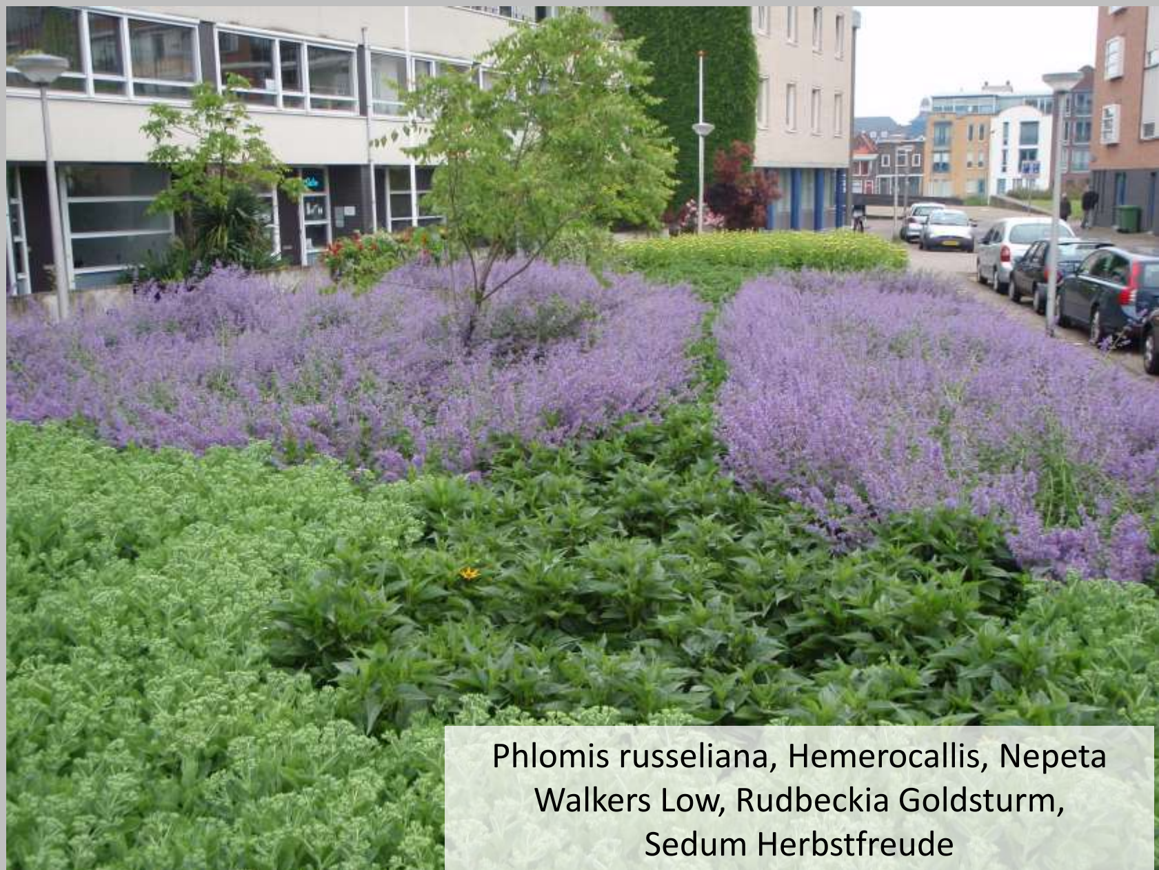
Phlox russeliana, Hemerocallis, Nepeta Walkers Low, Rudbeckia Goldsturm, Sedum Herbstfreude