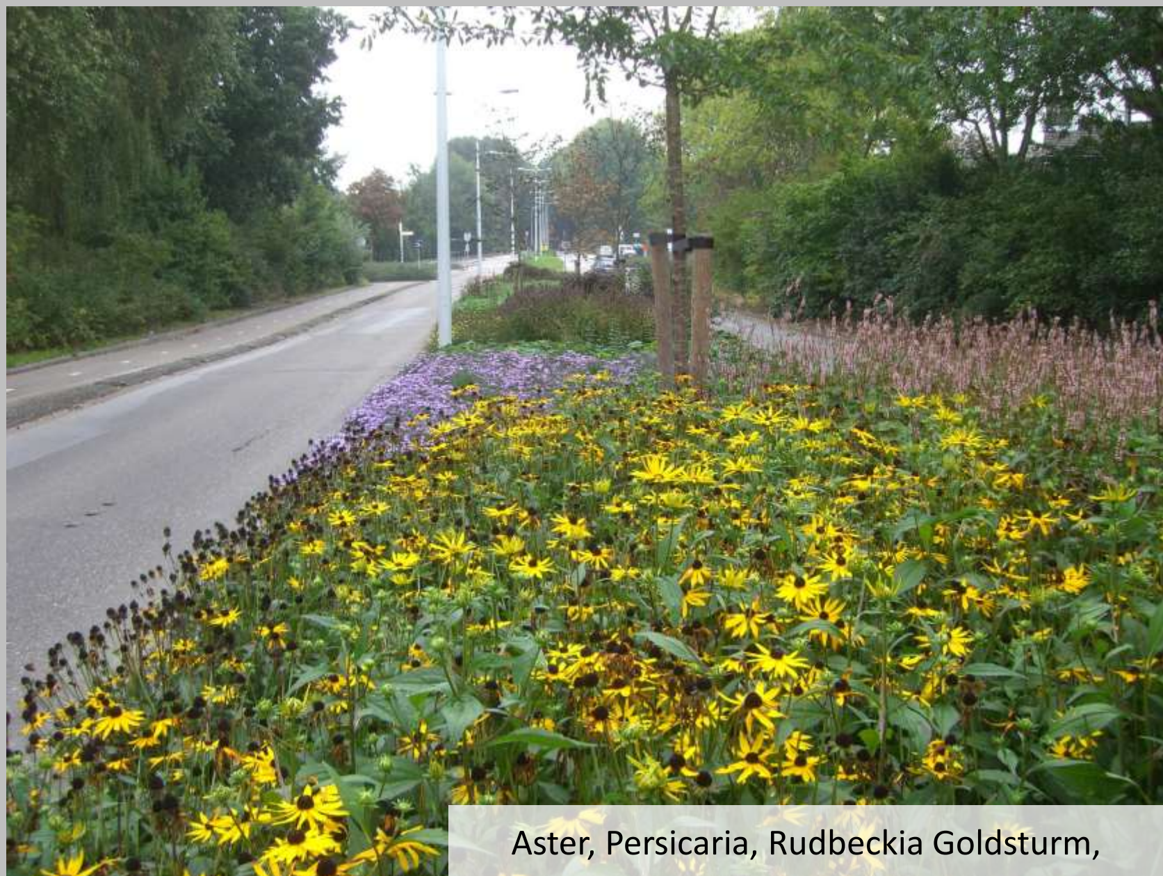
Aster, Persicaria, Rudbeckia Goldsturm,