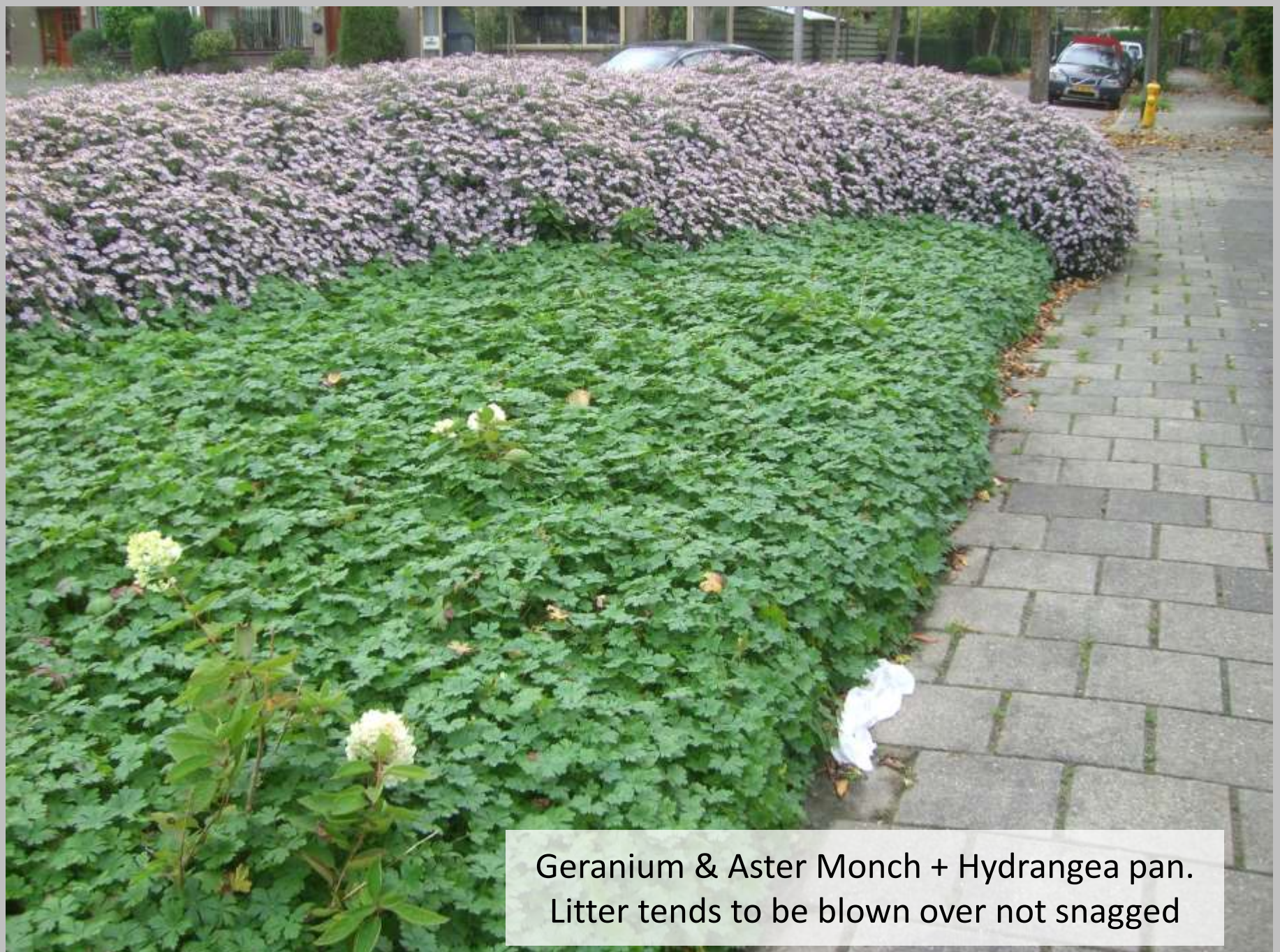
Geranium & Aster Monch + Hydrangea pan. Litter tends to be blown over not snagged