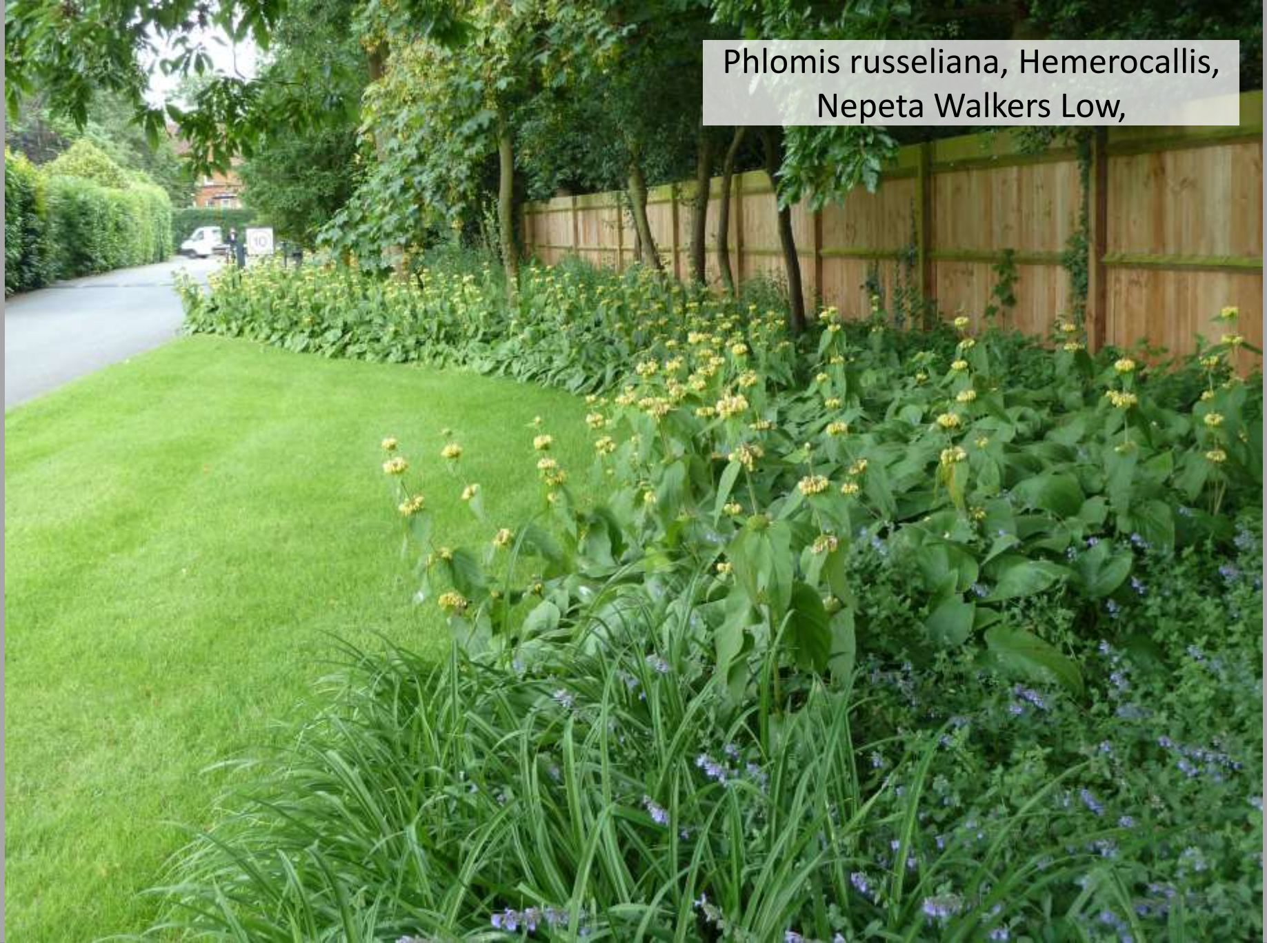
Phlomis russeliana, Hemerocallis, Nepeta Walkers Low,