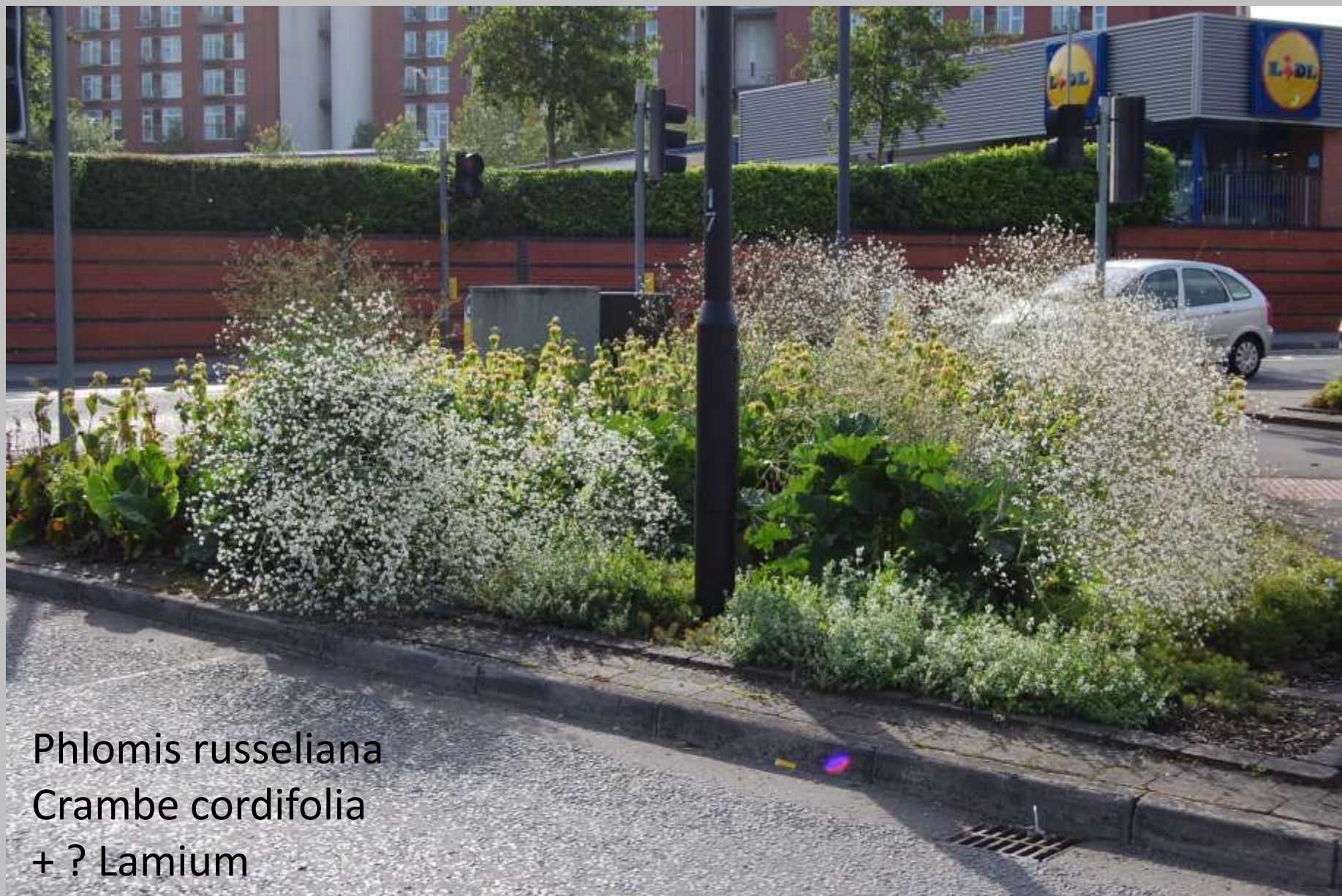
Phlomis russeliana Crambe cordifolia + ? Lamium